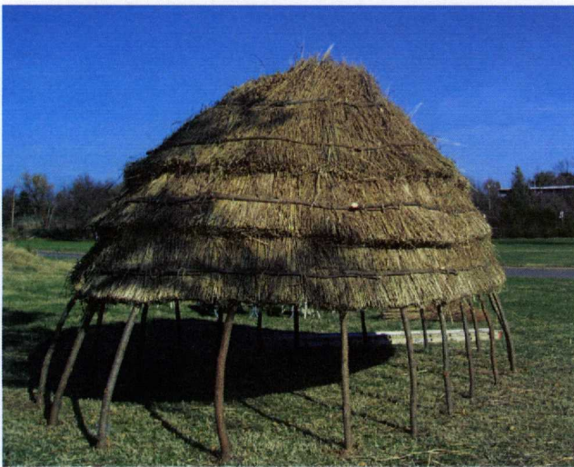
The Switchgrass Arbor is located on campus at Haskell Indian Nations University in Lawrence, Kansas

The grass arbor came about as a culminating activity for a two-year switchgrass research project. Haskell was awarded a contract by Fort Polk through the Engineering Research and Development Center/Construction Engineering Research Laboratories. The project allowed the university to collaborate with Fort Polk on research to determine the adaptability of switch grass as adequate ground cover for army installation lands.