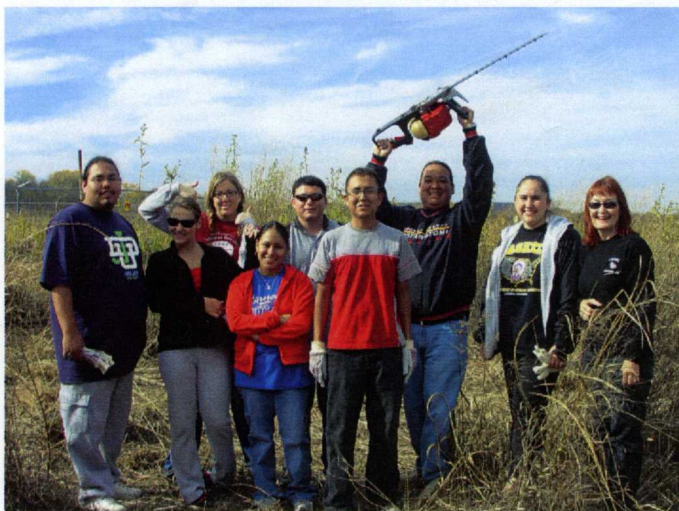
School of Education Juniors, class of 2008, in the Wetlands cutting switch grass.

During the week of October 20, 2006, School of Education (SOE) students participated in the building of the arbor on campus. The purpose for SOE student participation in this activity was twofold: to provide a service and to learn.